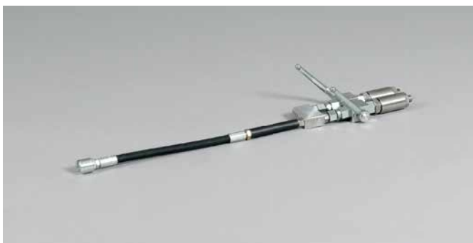
2C mixing head - steel