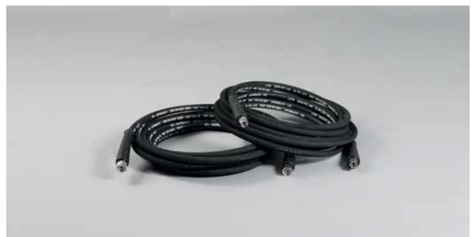
HP hose - steel

All information and data in this technical data sheet are based on the current state of technology. We reserve the right to make technical modifications. The consumption data given here are average values based on experience therefore deviations cannot be excluded. 09/2024